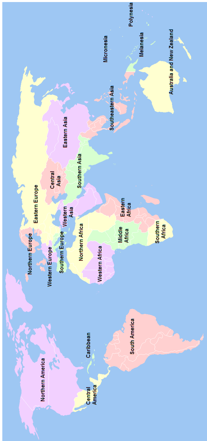
Figure 2: World regions classification recommended by United Nations Population Division